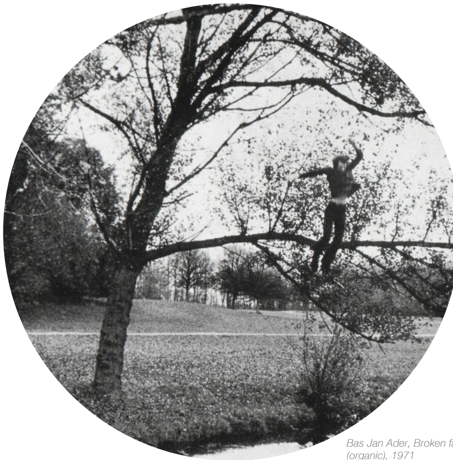
Bas Jan Ader, Broken fall (organic), 1971