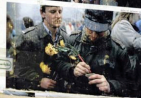
الجنود المجردين من السلاح